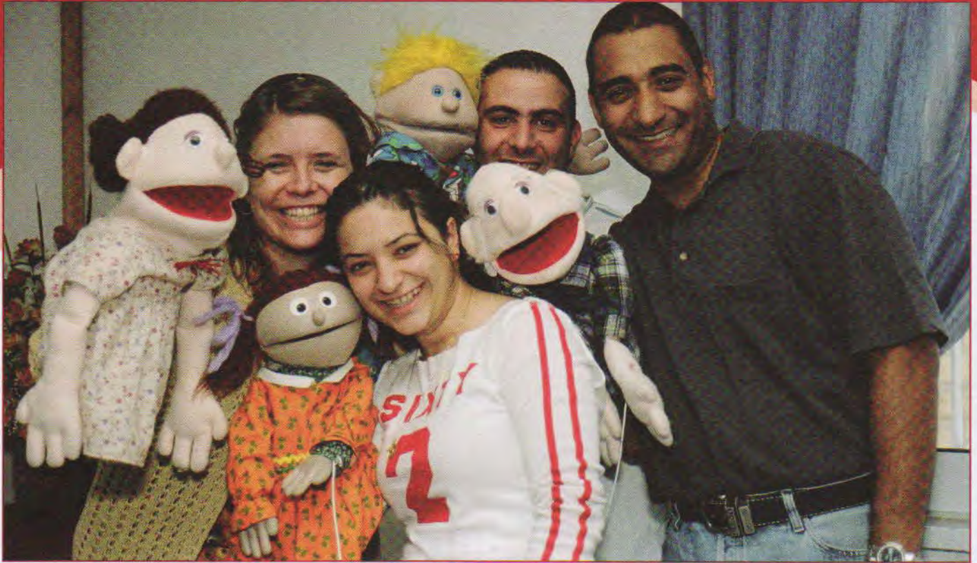
Puppet shows are one way in which the Palestinian Bible Society's Operation Palestinian Child team brings biblical messages to children.

This project started in Christmas 2000, and has reached over 20,000 children in churches, villages and schools.